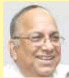
Chairperson Justice Ananga Patnaik Former Hon'ble Judge, Supreme Court of India