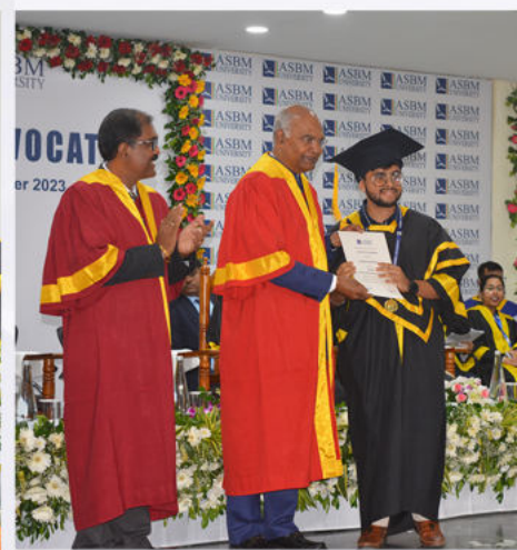
Students Receiving Gold Medals for their achievements from the Chief Guest HE Shri Ram Nath Kovind, Hon'ble Former President of India at Third Convocation ceremony of ASBM University.