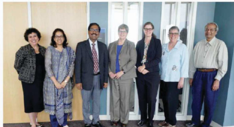
Team ASBMU with Team MSU at MSU, Minnesota, USA