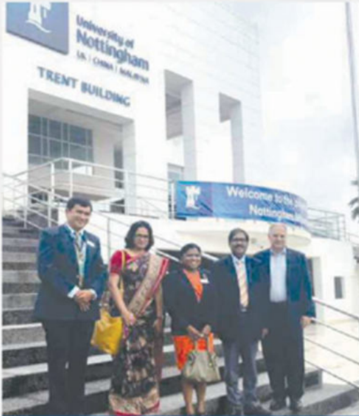
Team ASBMU with Team UNM in UNM Campus, Malaysia