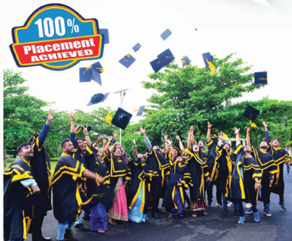
Kudos to passing out MBA Batch 2023 for 100% Placement

Not only MBA, BBA students also placed in reputed companies like TCS.