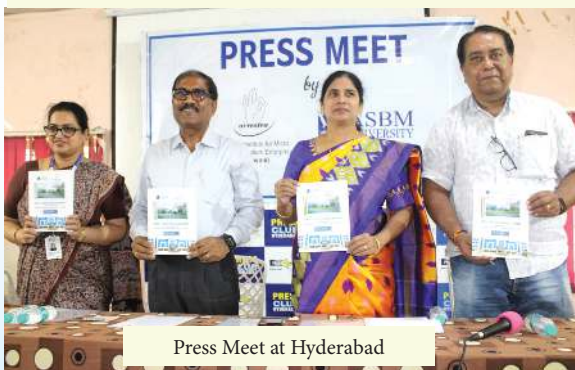
Press Meet at Hyderabad