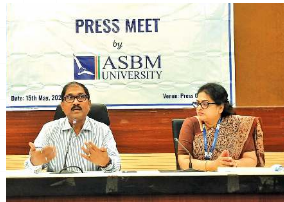
Press Meet at Ranchi