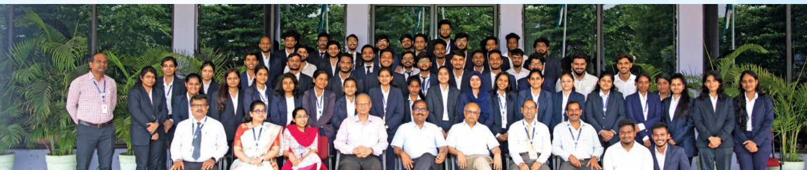
President, ASBM University and Members of Faculty with the final year under graduate students of the University