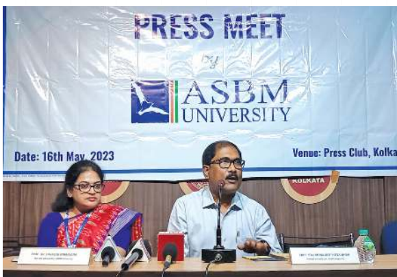
Press Meet at Kolkata