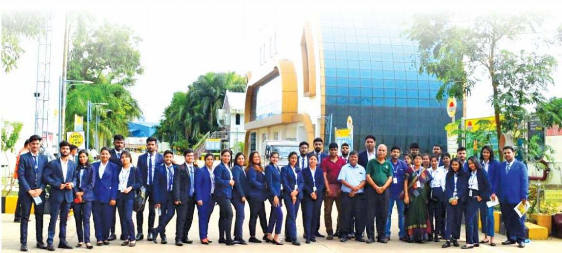
Industrial Visit to ORICLEAN Pvt. Ltd. 15th October, 2022